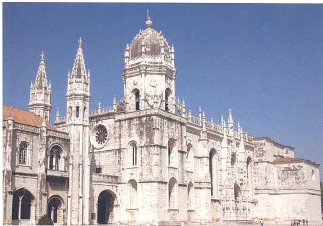
MEDALLIONS DEPICTING EXPLORERS AND PORTUGUESE ROYALTY, BELOW, THE CHURCH OF SANTA MARIA DE BELÉM, ADJACENT TO THE CLOISTER, RIGHT.